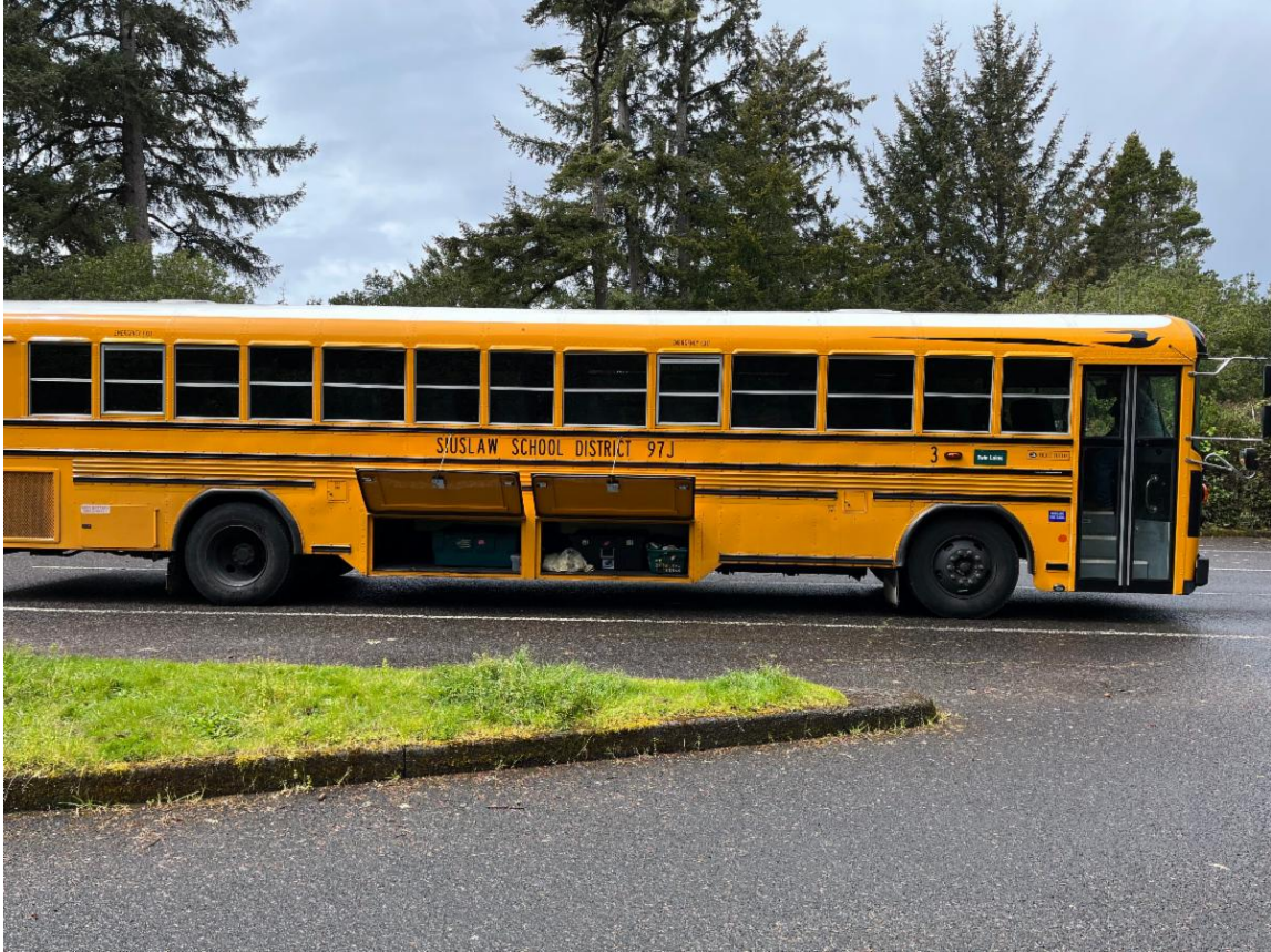
Above: A Siuslaw School District bus brings students to the dunes yearly to get some hands on education about invasive species removal and land stewardship.