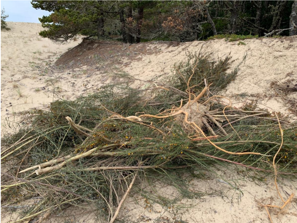
Above: A large scotch broom was cut into pieces to get to the base. Once the base of the scotch broom is exposed, then digging and removing as much of the plant is essential to prevent re-sprouting.

The NYC crew consisted of a small group of six young adults. The team worked for four days North of Florence and exceeded all expectations. They cut some very large scotch broom that was in full bloom. Thanks to the crew those cut broom will not be dispersing seeds this year. The crew did a great job of digging below to the root system of the scotch broom. Digging and cutting as low as possible is an important part when cutting down large scotch broom. It's recommended to dig around the base of the large scotch broom and then cut as low as possible prevent future re-sprouting of the plant. See photos below for an idea on how large these bases and roots are.