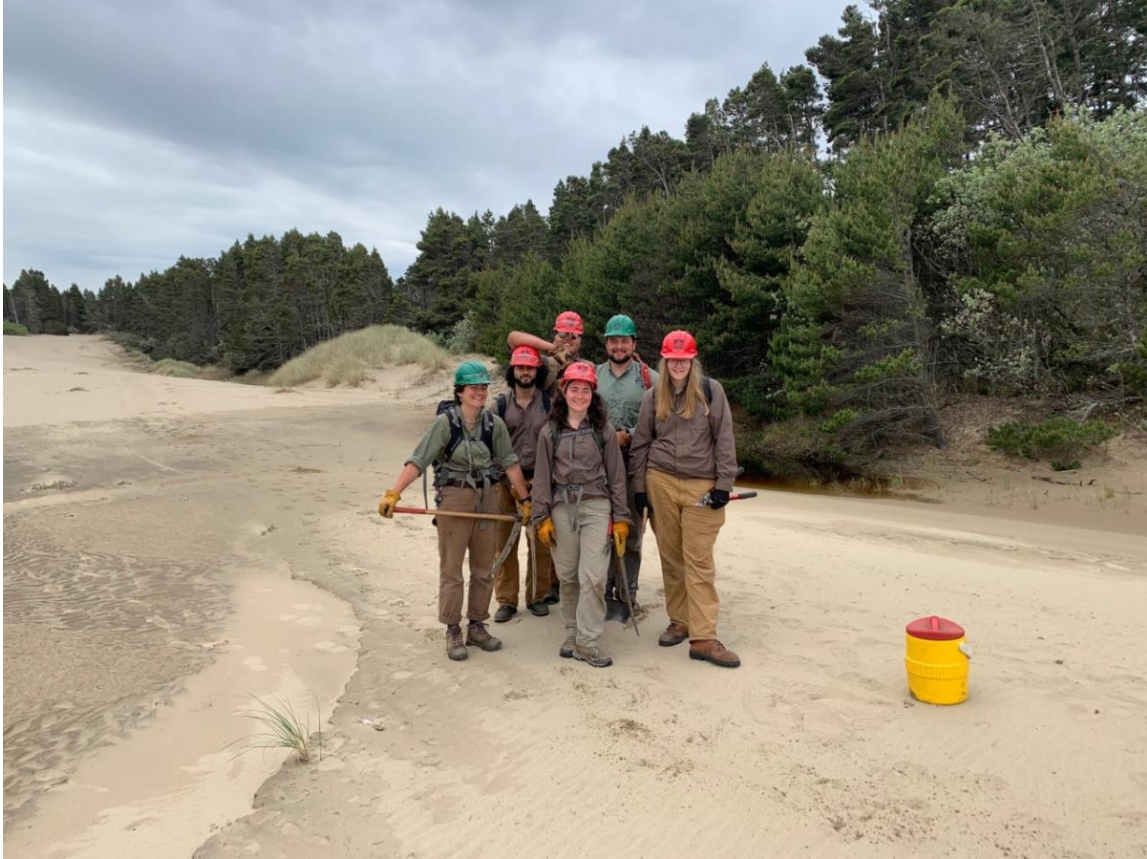
Above: The six NYC crew members.